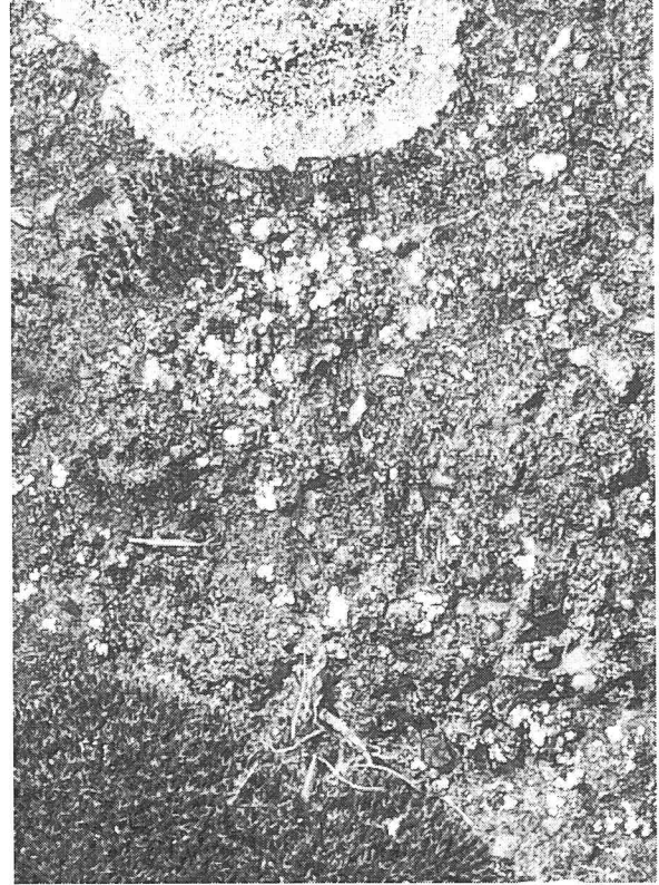
Various lichens and a moss ✧